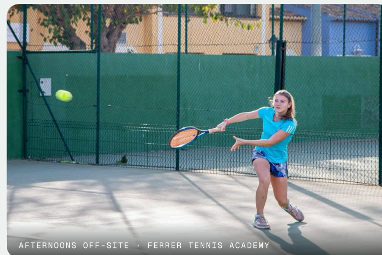
AFTERNOONS OFF-SITE · FERRER TENNIS ACADEMY